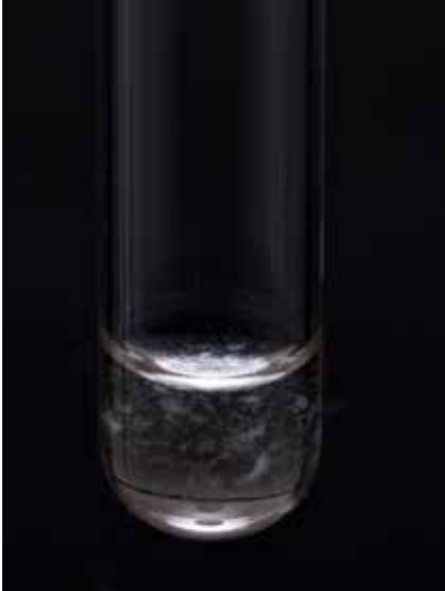
Figure 4. Positive H-agglutination