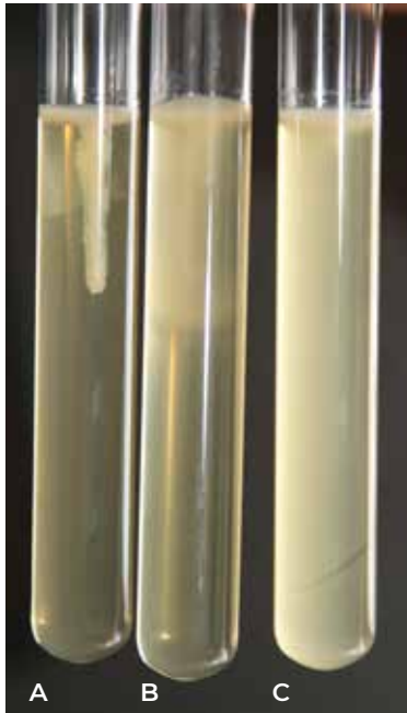
Figure 3. A) Non-motile E. coli (fluid is clear). B) A motile E. coli which has grown almost halfway down (fluid is cloudy where it has grown). It needs to be subcultured to reach full motility, before serotyping the H antigen. C) The fully motile E. coli which has grown all the way down (fluid is cloudy).

When performing a motility test (using a microscope), antibody and bacteria are mixed on a glass slide. The mixture is covered by a cover slip. A positive agglutination appears as clots in a solution of free-swimming bacteria. A negative test result (no agglutination) appears as free-swimming bacteria without clots. It is important to use an equal amount of antigens and antibodies.